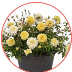
Scentifall Lemon ('VPRO 14-02') Compact and slightly spreading, this fragrant double yellow rose is well-suited for hanging baskets, patio pots and low borders.