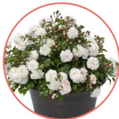
Scentifall Blush ('VPRO 14-08') Very compact and dense, this sweetly-scented double blush rose is floriferous and is well-suited for hanging baskets, patio pots and low borders.