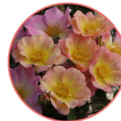
Watercolors Home Run ('WEKsolcibarko') Large clusters of ruffled single blooms on this shrub rose open bright pink with yellow petal bases and gently transition to shades of pink and cream.