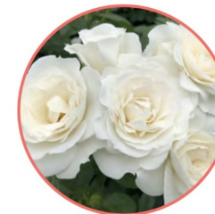
White Veranda ('KORfloci111') Compact and bushy, this floriferous floribunda boasts double clear-white blooms. It is great for patio pots and borders.