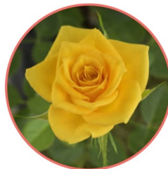
Sunrosa Yellow Delight ('ZARsunornu') Well-formed, double yellow blooms are produced singly and in small clusters on this miniature shrub rose.