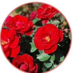
Sunrosa Red ('ZARsbjoh') Rich-red, loosely double blooms are generously produced over this dense and symmetrical miniature shrub rose.