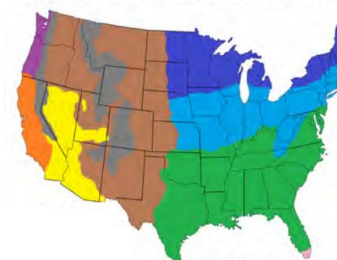
Köppen Climate Regions of the Continental U.S.

There are 13 roses which have won at least one A.R.T.S. regional award for 2024 (Local Artist award winners). Among them are three roses that have earned the coveted A.R.T.S. Master Rose status, winning in four or more regions. All the roses have proven themselves to be beautiful, durable and hardy in their winning region(s).